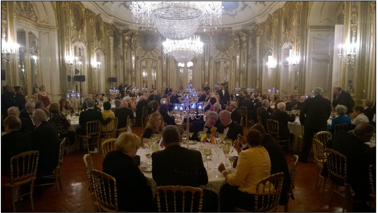
Gala Dinner at the Grand Dining Room of the historic Queluz Royal Palace, the summer residence of the Portuguese Kings dating to the 17 th century