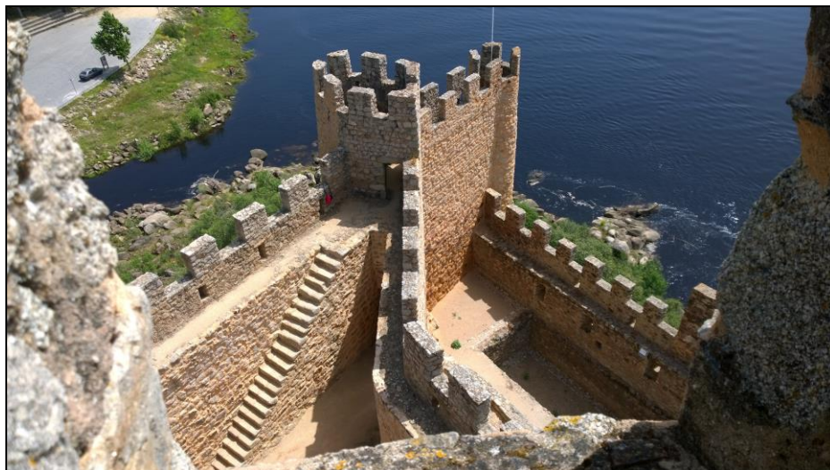
The Castle of Almourol; a Knights Templar medieval castle built on a small islet in the middle of the Tagus River, Portugal.

Both Dominic De Candia, our Grand Secretary General, and I had planned a day trip to visit Knights Templar castles prior to the Conference and it was a day well spent discovering the history of the Knights Templars in Portugal. The female guide was impressed with our knowledge of Knights Templar Grand Masters etc.