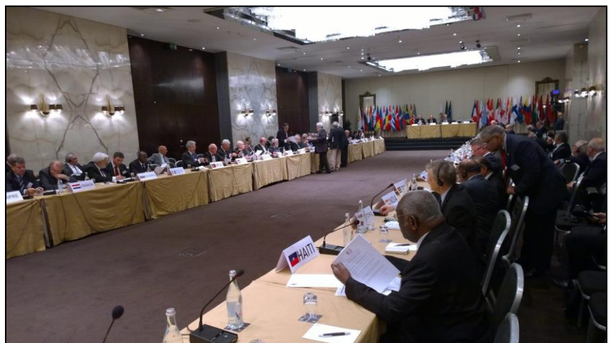
Over 40 countries represented at the 19 th World Conference of the Supreme Councils 33°

service to provide accurate translations of unfamiliar Masonic terms and titles but we managed to make our thoughts known to each other. Three days of discussion and paper presentations took place but often informal discussions at social events and over meals were just as effective and much was learned from each other.