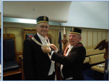
SGC investing the LGC