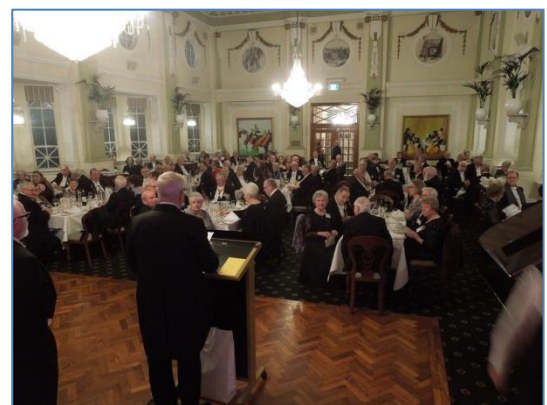
AASR Aust Gala Dinner 2017