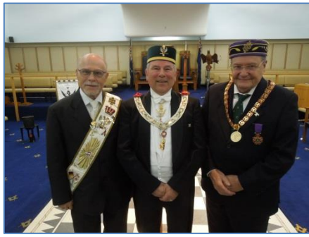
SGC with German & Mauritian SC Members