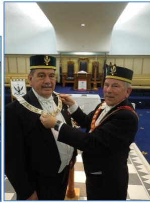
SGC Investing RC Region 3